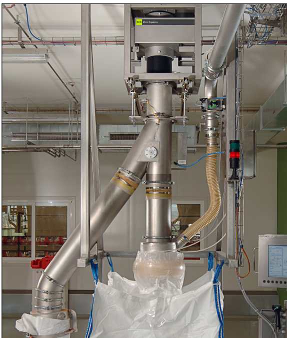
IFS compliant metal detection directly before the filling of spice products into bigbags.