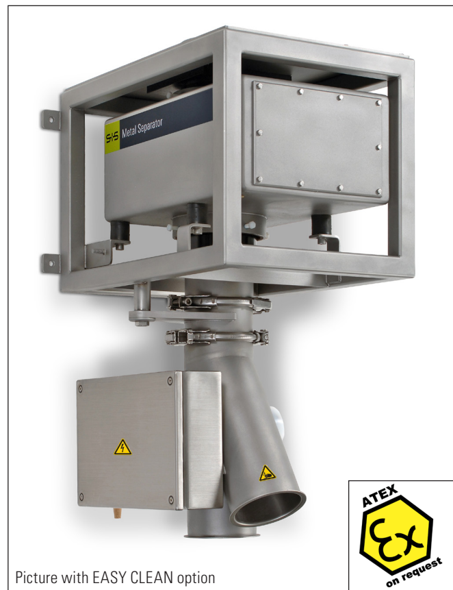
Picture with EASY CLEAN option